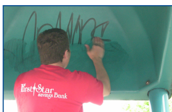
First Star Bank Volunteer Fights Blight

According to the National Association of Realtors, the presence of graffiti in a neighborhood reduces the value of its homes by 15%, if the graffiti is hateful, 25%! Translation: if your house is worth $200K it's a $30,000 hit you are taking. For a few bucks worth of spray paint and Sharpies, a graffiti vandal is taking $30 grand out of your pocket. Graffiti pg. 3